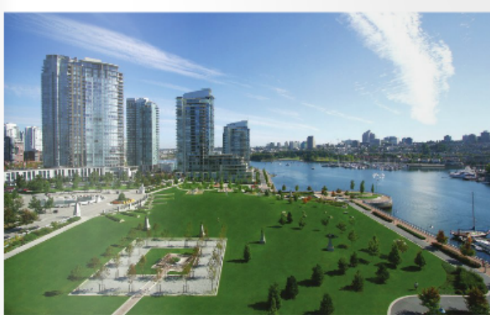
George Wainborn Park in Yaletown is a superb example of Concord Pacific's success in revitalizing a neighbourhood

park-side alternative," Meehan says. The green space will be developed as "a combination of passive and sports/events programming with recreational infrastructure interlaced," he adds, and a proposed new public school is also planned as part of the community.