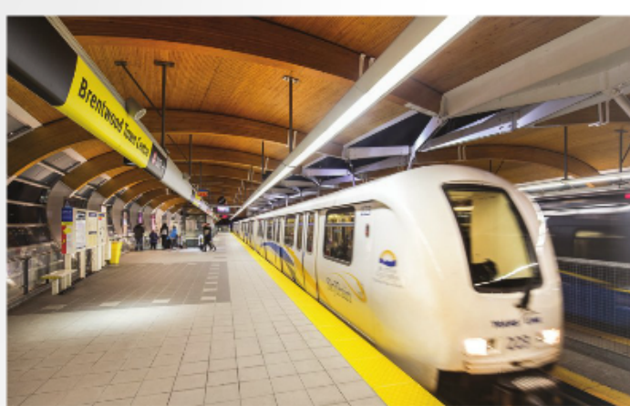
SkyTrain links and a fantastic shopping mall at Brentwood Town Centre are a stone's throw away from Concord Brentwood

Brentwood's enviable central location, 20 minutes from downtown Vancouver, offers easy access to Trans-Canada and Lougheed highways. The Brentwood SkyTrain station on the Millennium line connects to the Expo line as well as the future Evergreen line to Port Moody and Coquitlam. The recently opened Whole Foods supermarket at the intersection of Lougheed Highway and Willingdon Avenue, Save-On-Foods at Madison Centre and a growing array of shops, restaurants and amenities are