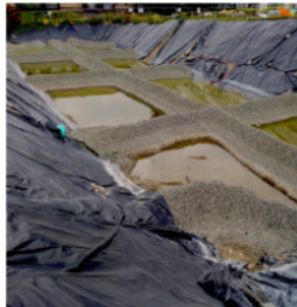
Retention pond to manage rainwater.

Late this fall, the first release of homes at the Black + Whites on Foster will be available to purchase and move into. If you'd like to learn more about the Black + Whites on Foster visit blackandwhites.ca and register to be among the first to see them.