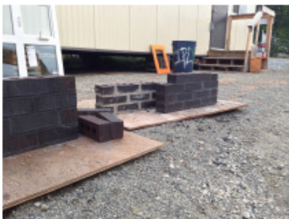
On site mock ups for the perfect bricks and mortar.

result will be contemporary, functional and well considered.