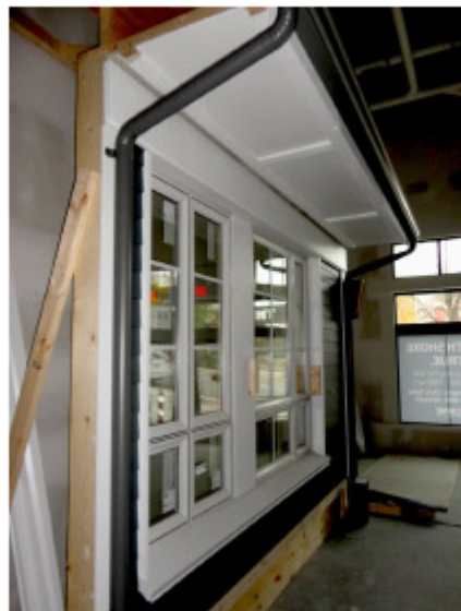
Too tall to fit as one. The third floor façade mock up.

Building the mock up also gave the construction team an opportunity to work out how things could be built on site, which has made the construction process run smoother and more efficiently.