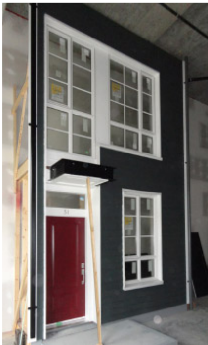
First two floors façade mock up.

In effect, they built a prototype and from that they identified and resolved some of the most minute considerations. They were able to