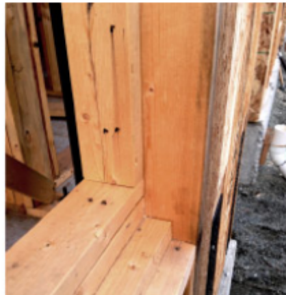
Detail of double-thick front wall construction.